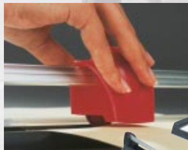
Trimmers & Guillotines